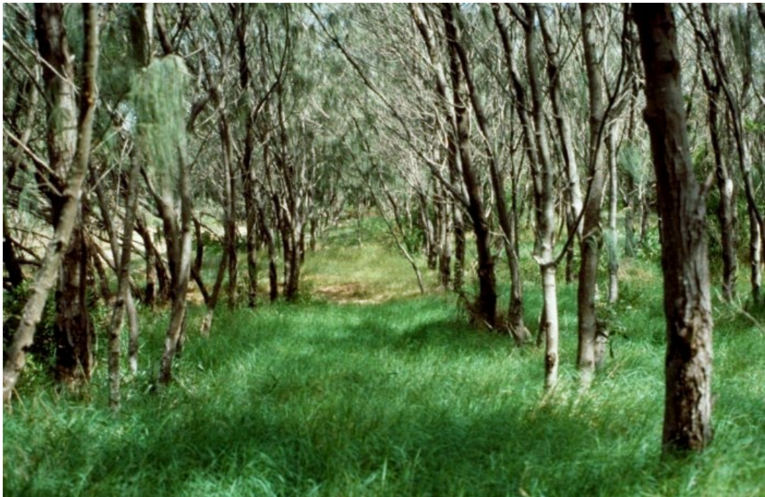
Figure 10. The same area as shown in Figure 9 soon after the start of an eradication campaign.