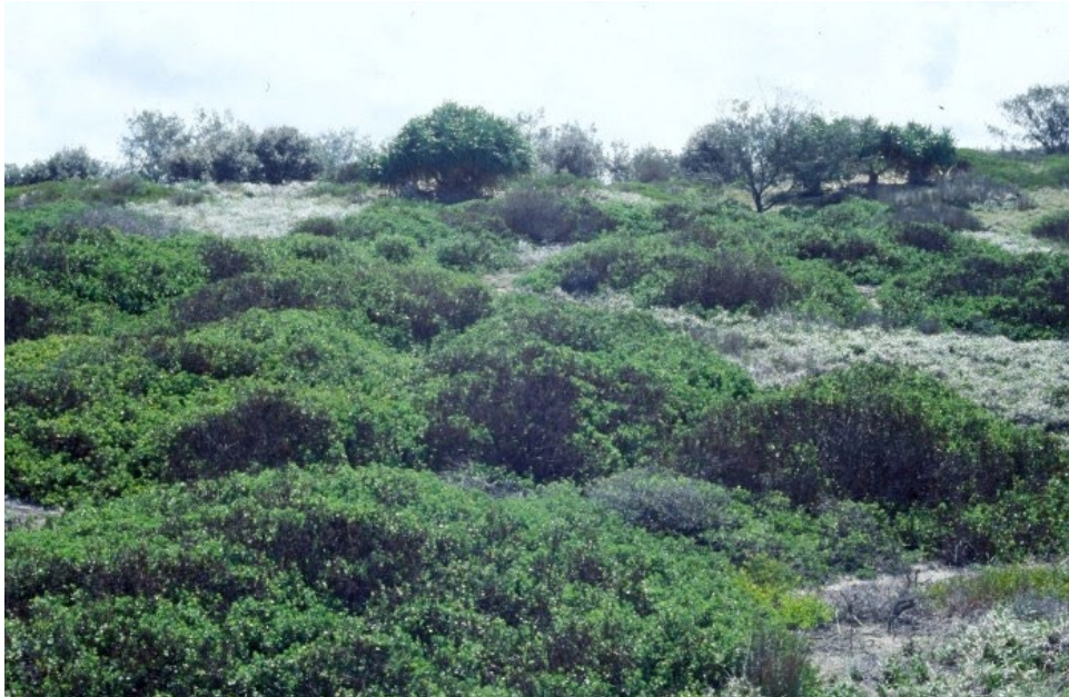
Figure 11. Dense bitou bush on open frontal dunes at North Stradbroke Island in 1992.

A large infestation detected on North Stradbroke Island around 1992 was initially targeted by a ‘SWEEP’ campaign (a short-term statewide weed-control initiative), followed by biannual search-and-destroy efforts. When the eradication program started on the island in 1992, bitou bush was well established at several locations on the island (see Figure 11). The population has since been dramatically reduced (see Figure 12).