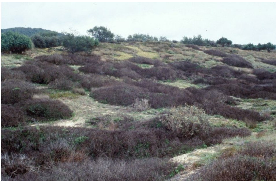
Figure 12. The same site as Figure 11 after initial control of bitou bush—all brown material is dead bitou bush.