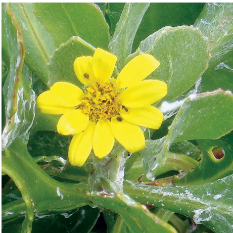
Figure 3. The bitou bush flower.

Leaves and stems of juvenile plants are typically covered by a cottony down. The flowers are yellow, chrysanthemum-like, up to 20 mm in diameter and clustered at the ends of branches (see Figures 3 and 4). The berries have green, fleshy skin that changes to brown and black when mature (see Figure 5). Each berry contains a single egg-shaped seed, which is 5–7 mm long and dark brown to black when dry (Agriculture and Resource Management Council of Australia and New Zealand 2000; Department of the Environment and Heritage and CRC for Australian Weed Management 2003).