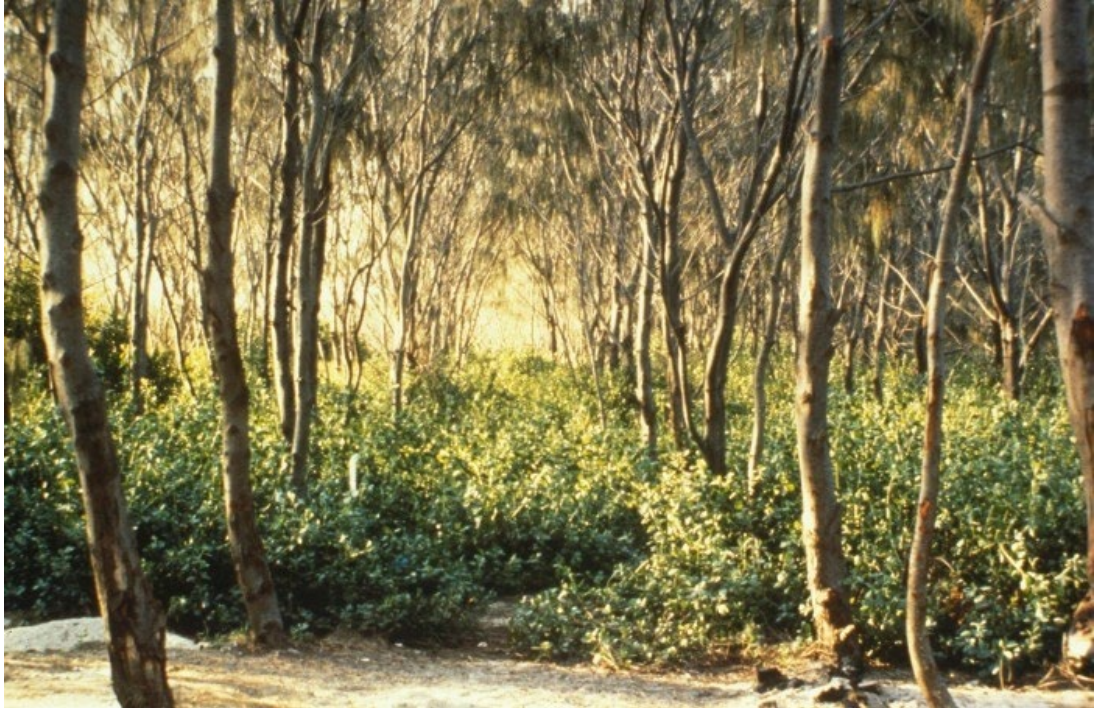
Figure 9 A pure understorey of bitou bush (beneath rows of coastal casuarina) at Rainbow Beach in 1982 (Photo: Tom Anderson, Biosecurity Queensland).