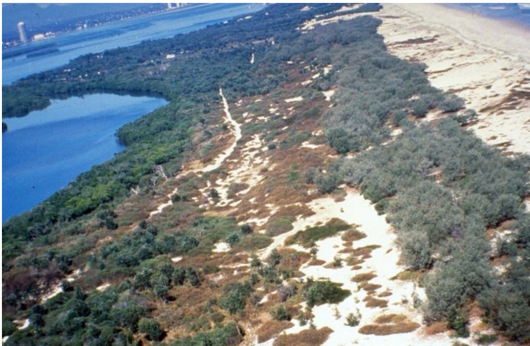
Figure 8. The same area as shown in Figure 7, but with all bitou bush plants (the brown plants) destroyed by herbicide.