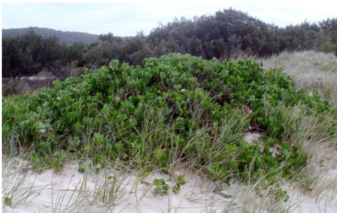
Figure 1. Bitou bush on frontal dunes—when subject to strong winds, the plant adopts a prostrate habit.

Bitou bush is a perennial, evergreen, woody shrub. When exposed to harsh conditions on coastal frontal dunes it grows prostrate, sometimes less than 0.5 m tall (see Figure 1). However, when protected from strong winds, it is usually 2–3 m tall. Sometimes it reaches 6–8 m when climbing through other shrubs, such as coastal banksias (see Figure 2).