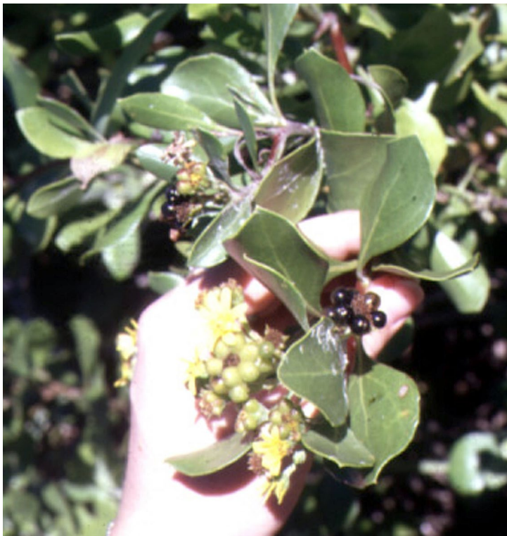
Figure 5. Ripe fruit on a bitou bush.