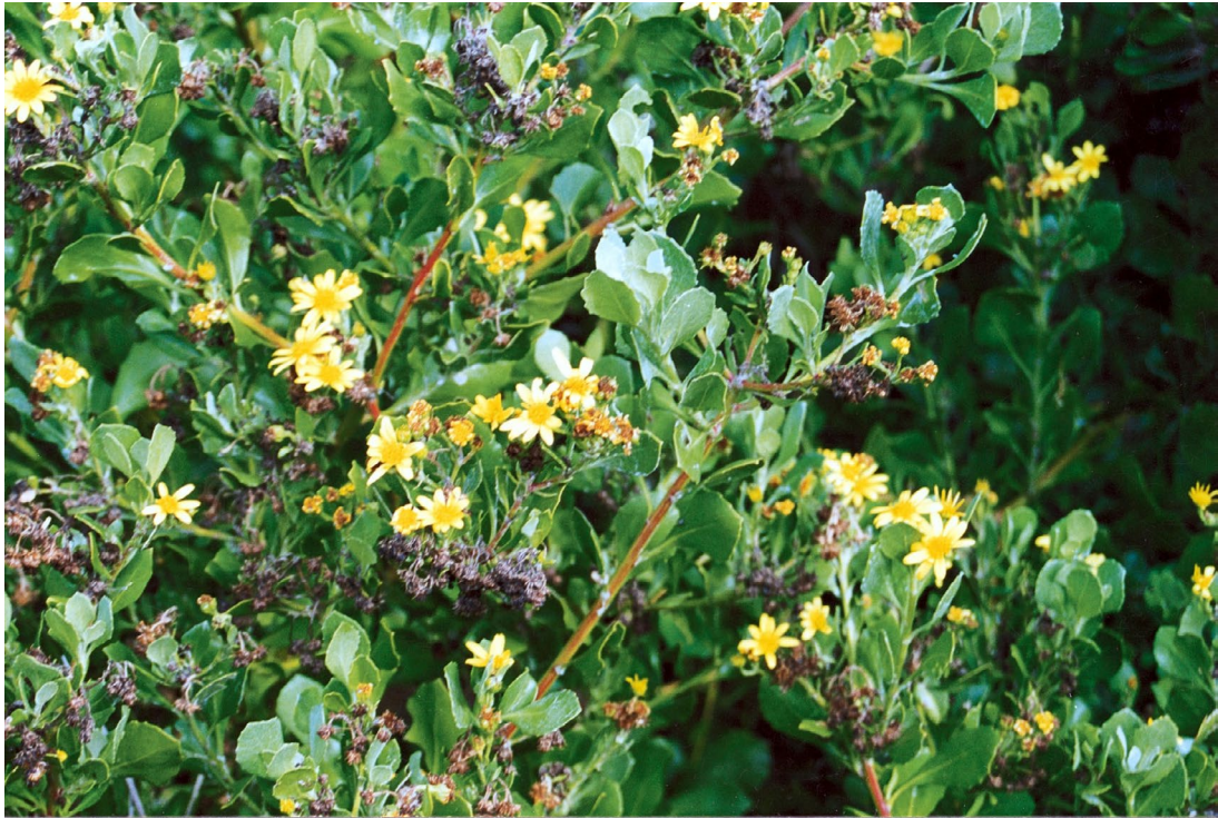
Figure 4. Clusters of bitou bush flowers.