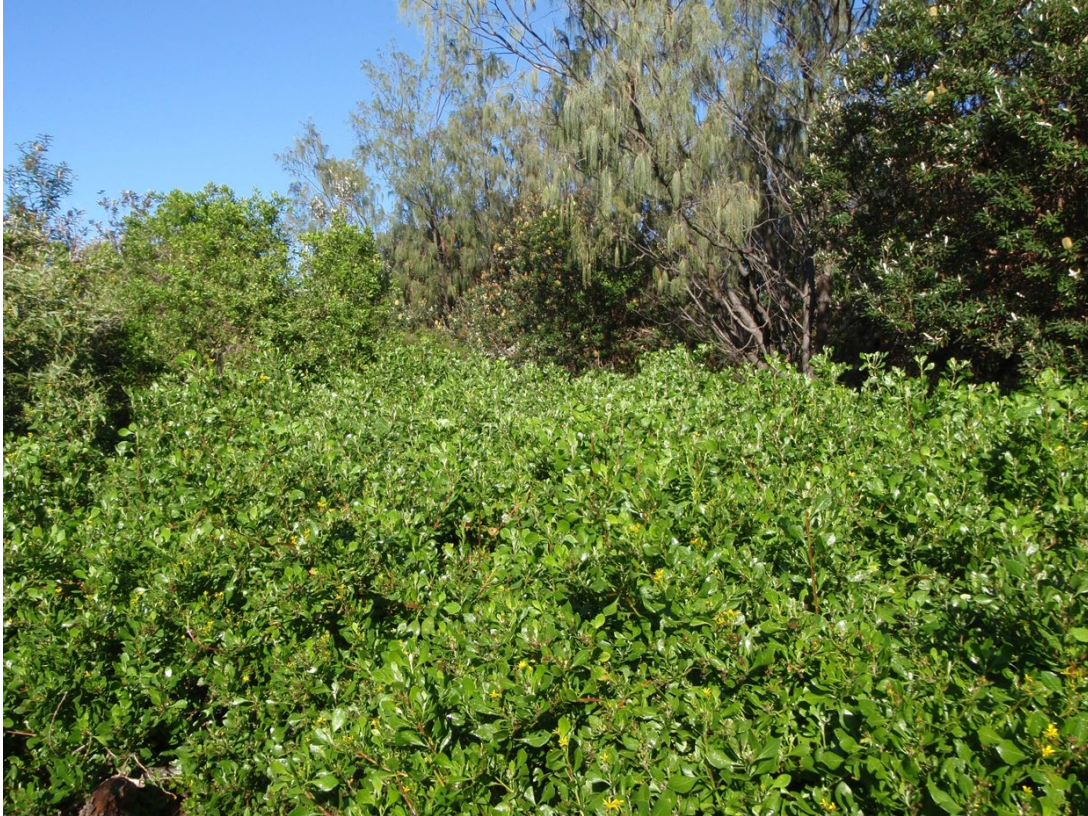
Figure 2. Bitou bush growing among taller dune vegetation.

The leaves are arranged alternately along the stems. They are bright green, 20–50 mm long, semi-succulent, oval to oblong in shape and tapering at the base. They have smooth edges.