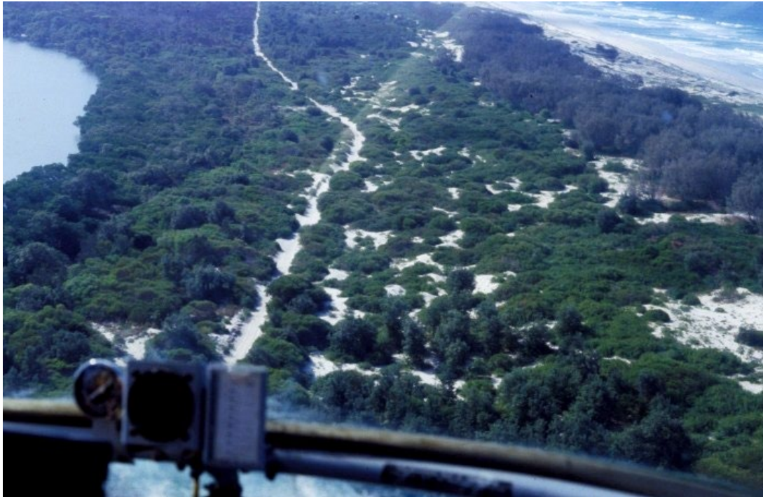
Figure 7. Extensive bitou bush (the bright green plants) on South Stradbroke Island in May 1986.